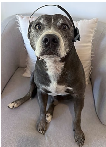
THOR Chief Office Dog 12 Years Continued Service